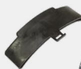
Plastic protection for bead breaker suitable